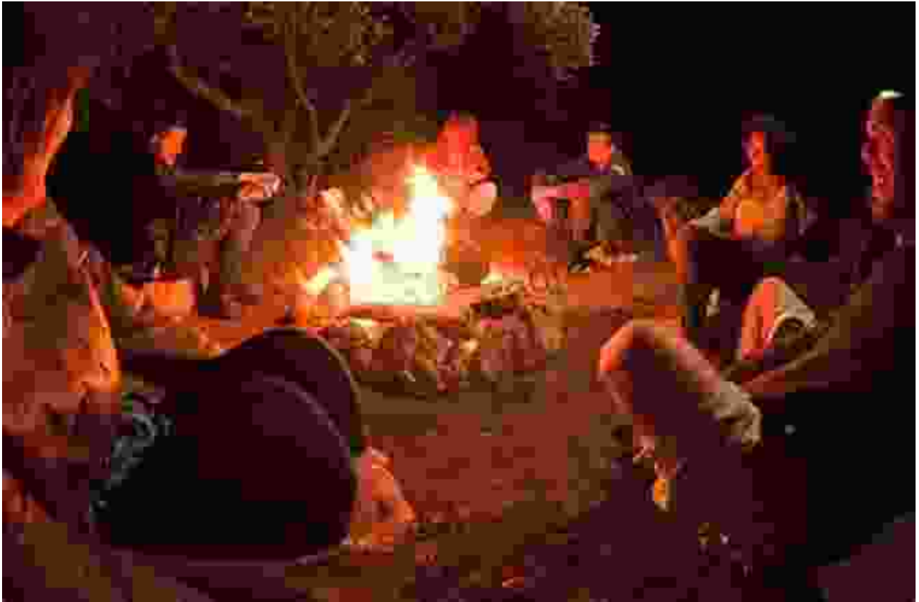
Caption: Zapatista communities have been at the forefront of a transformative movement for Indigenous autonomy and self-determination.