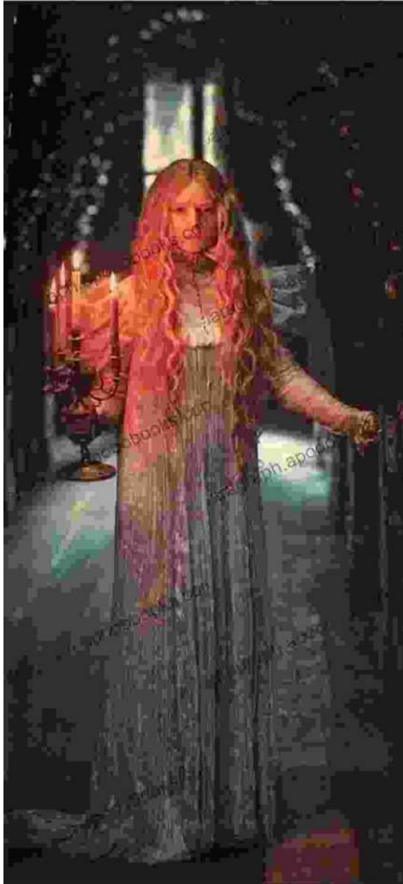
Edith's transformation in Crimson Peak (2015)