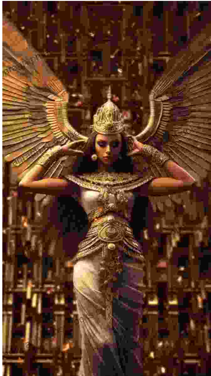
Kali: The Goddess of Destruction and Renewal