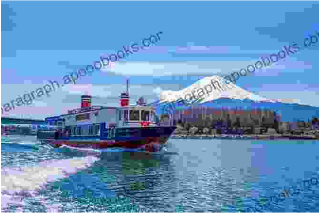
Lake Kawaguchi is one of the most beautiful lakes in Japan.